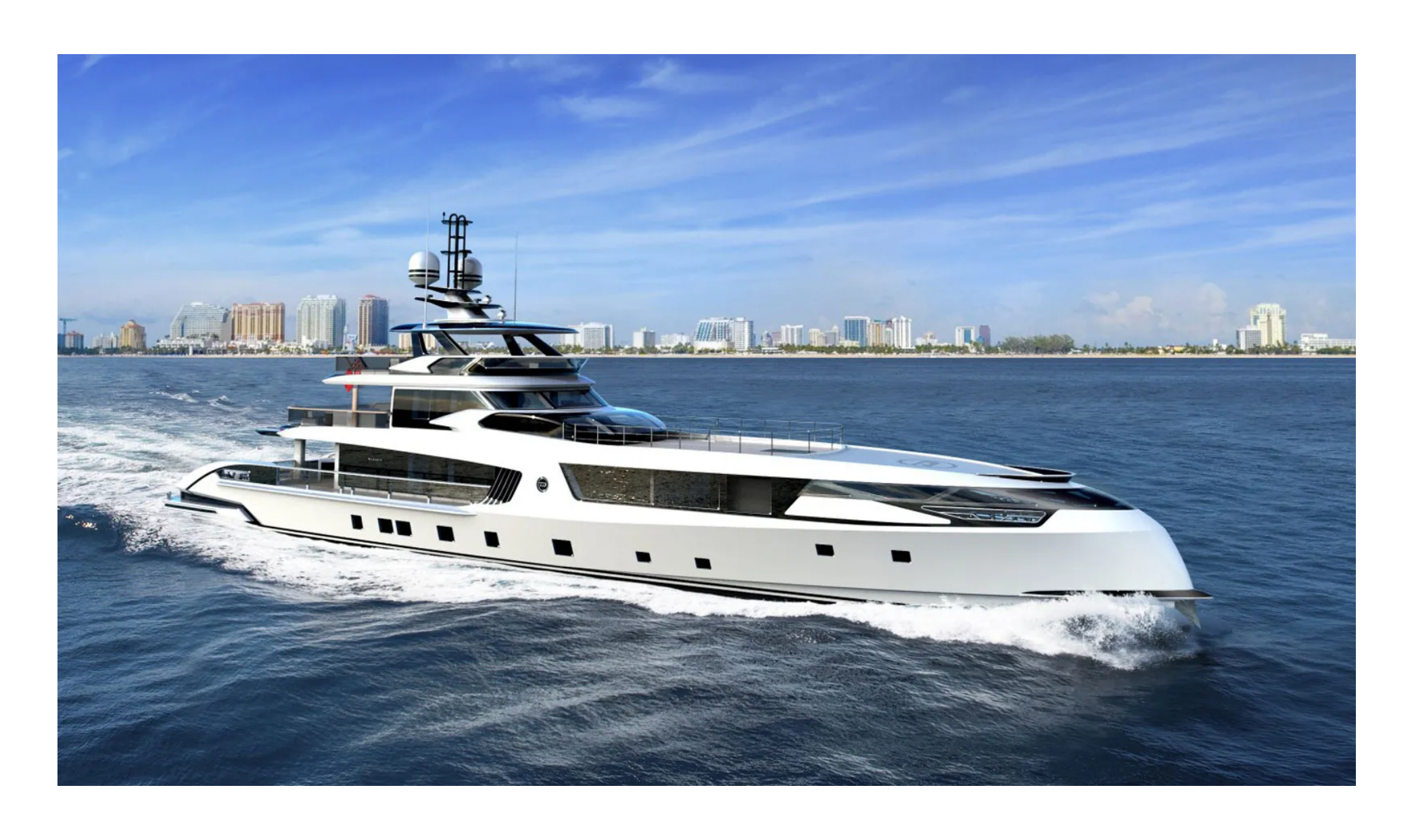
GTT 165: Dynamiq begins construction on new 50m flagship