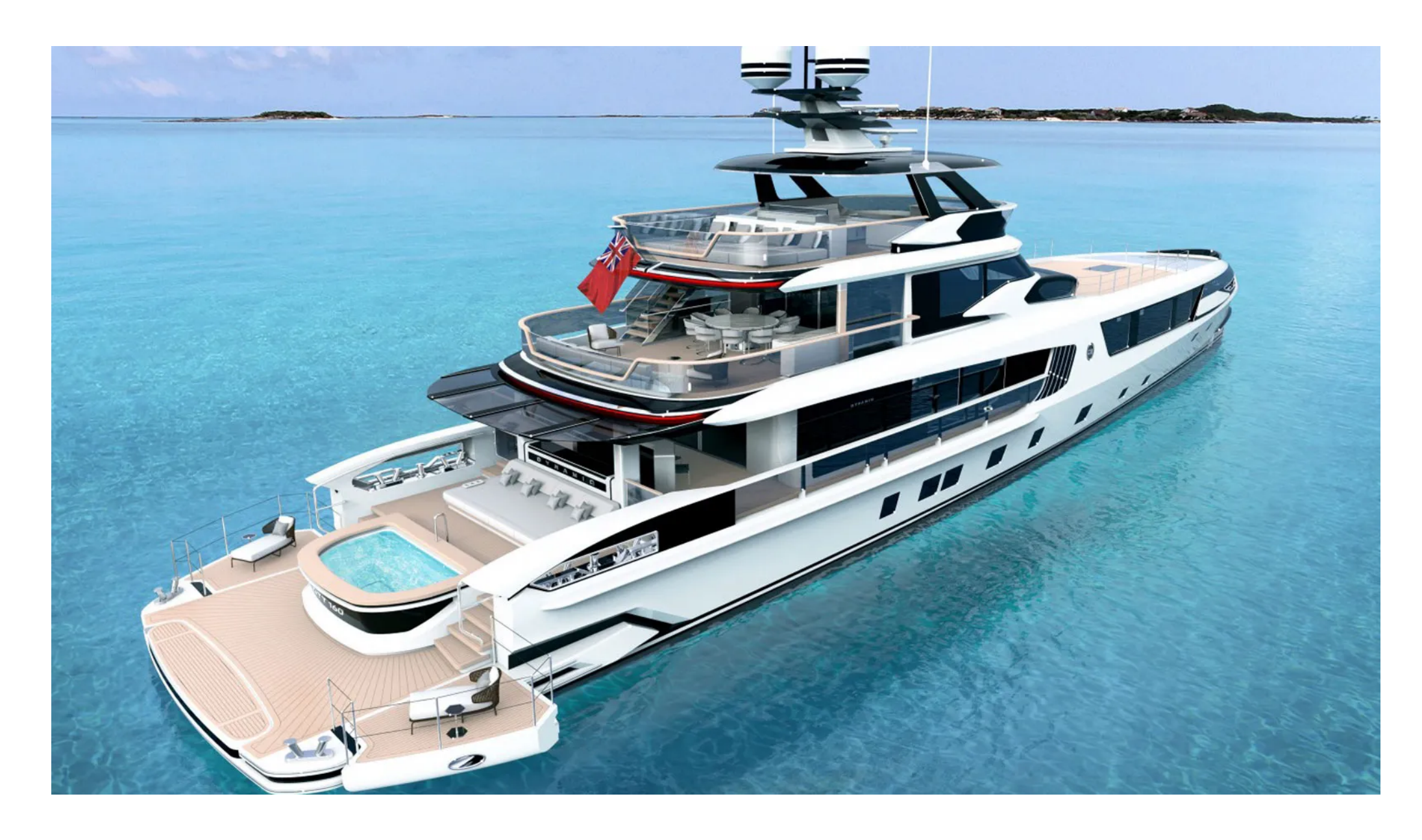
The GTT 165 features six spacious guest cabins, including a full-beam owner's stateroom on the main deck which is finished in relaxed Maldivian style. Elsewhere, key features include an open-air beach club complete with a 12-person pool and unfolding terraces.