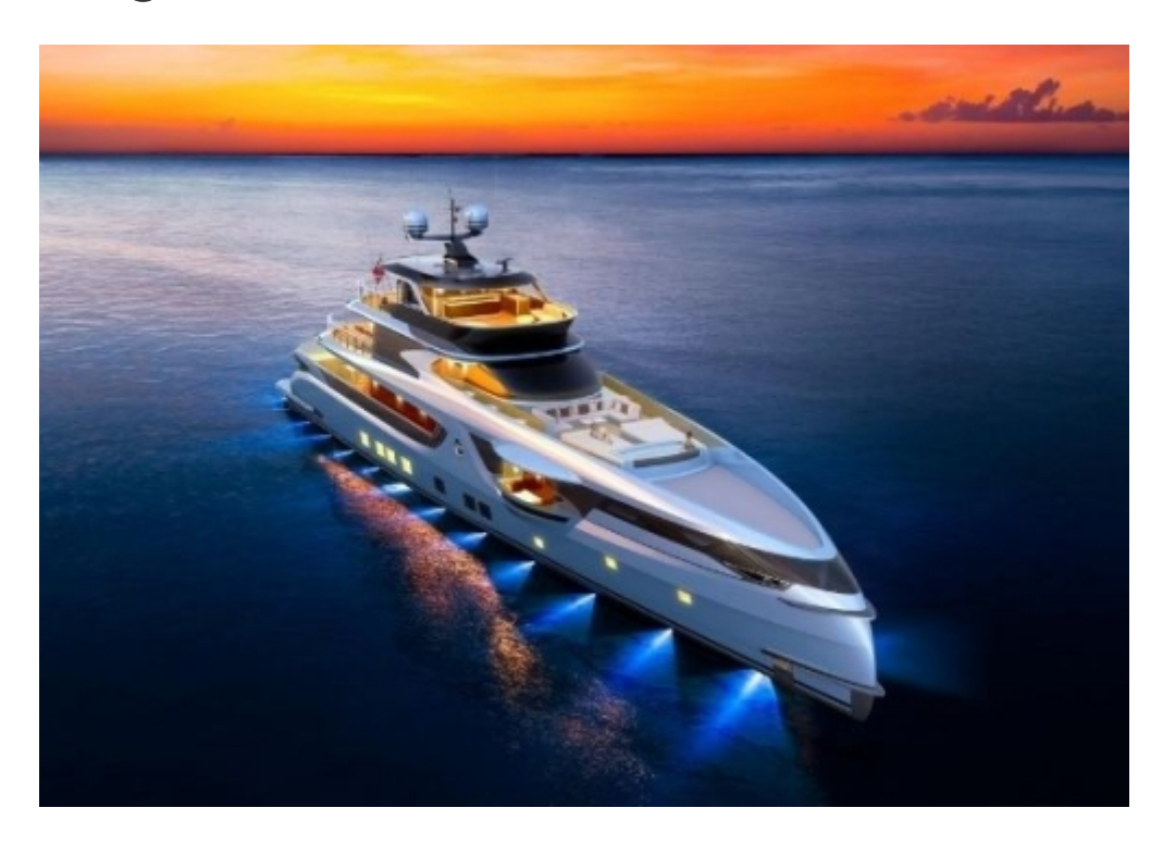
Dynamiq is proud to present the