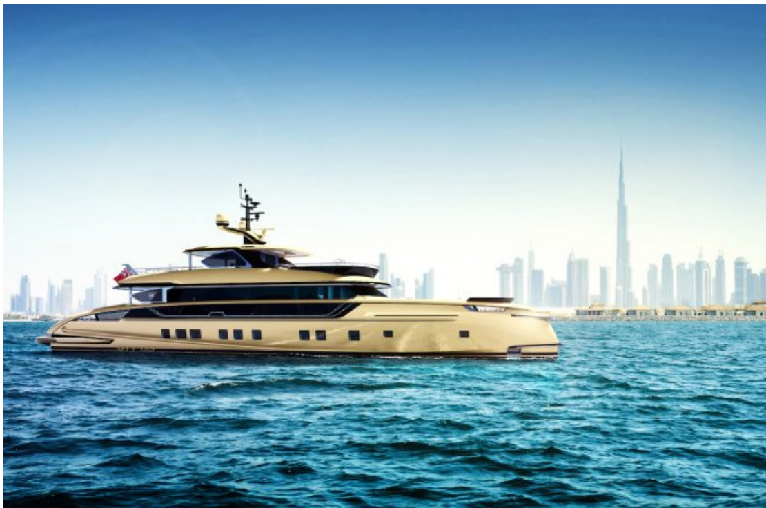
GTT135 CARAT in Dubai

Dynamiq has unveiled a new limited edition GTT 135 luxury yacht named the GTT 135 CARAT, which has been designed with the Middle Eastern market in mind.