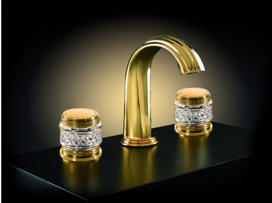
GTT135 CARAT Serdaneli

The limited edition superyacht sports a 'Royal Gold' hull and superstructure, gold accessories by Serdaneli in the bathrooms and even gold-plated cylinder heads on the twin MAN engines.