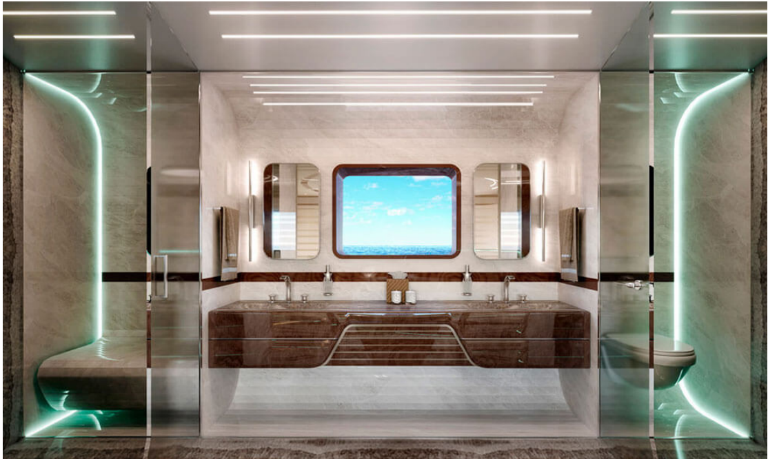
The Dynamiq GTM 90 head.

Outside, the exterior styling of the superstructure has taken cues from automotive design with a sports car sleekness somewhat akin to a Lamborghini Urus. Up top there is a cozy sundeck with sunbed behind the radar mast accessed by an exterior staircase and a 3-seat sofa in the bow to enjoy the thrill of cruising at speed. The GTM 90 also has the ability to carry a 5.5m x 5.5m inflatable FunAir pool with a protective net for guests that prefer to avoid swimming in open water.