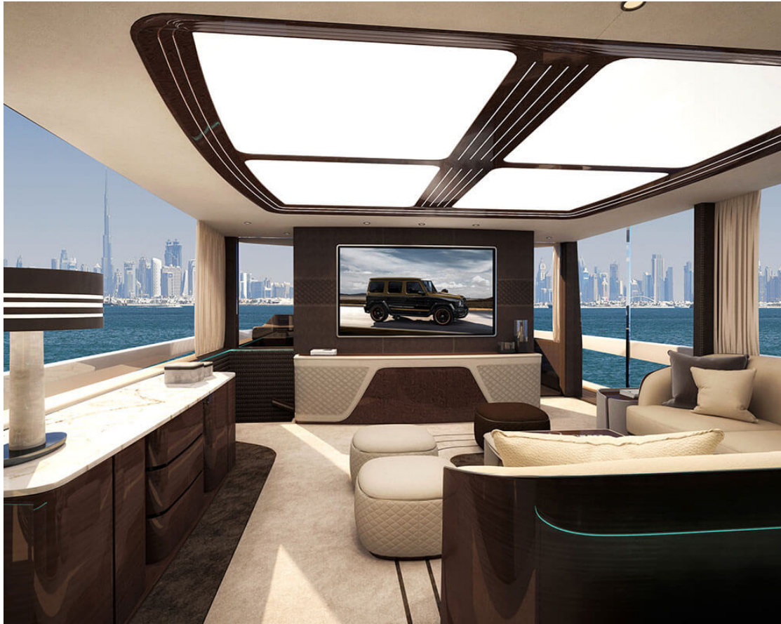
The price of the Dynamiq GTM 90 starts at 7.5M Euro.