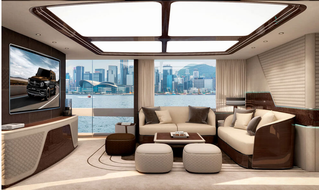
A view of one of the Dynamiq GTM 90 saloon configurations.

throughout the main deck are a generous 2.20m throughout. Dynamiq also provides a second option for the main deck layout, where saloon and dining area are united to form a larger space for groups of up to 16 people.