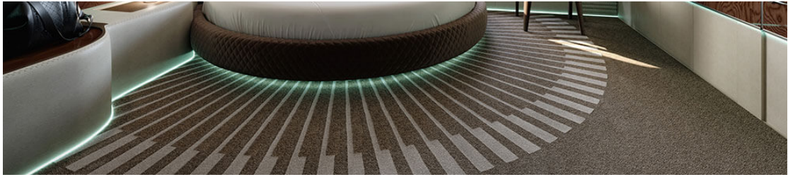
Dynamiq GTM 90 owner's cabin with a circular bed from the Bentley Home Collection.