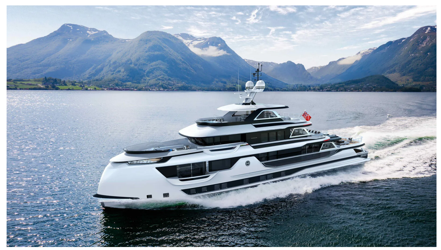
The Global series

Both the GTT and Global lines will be built on Fast Displacement hulls by Dutch naval architect Van Oossanen.