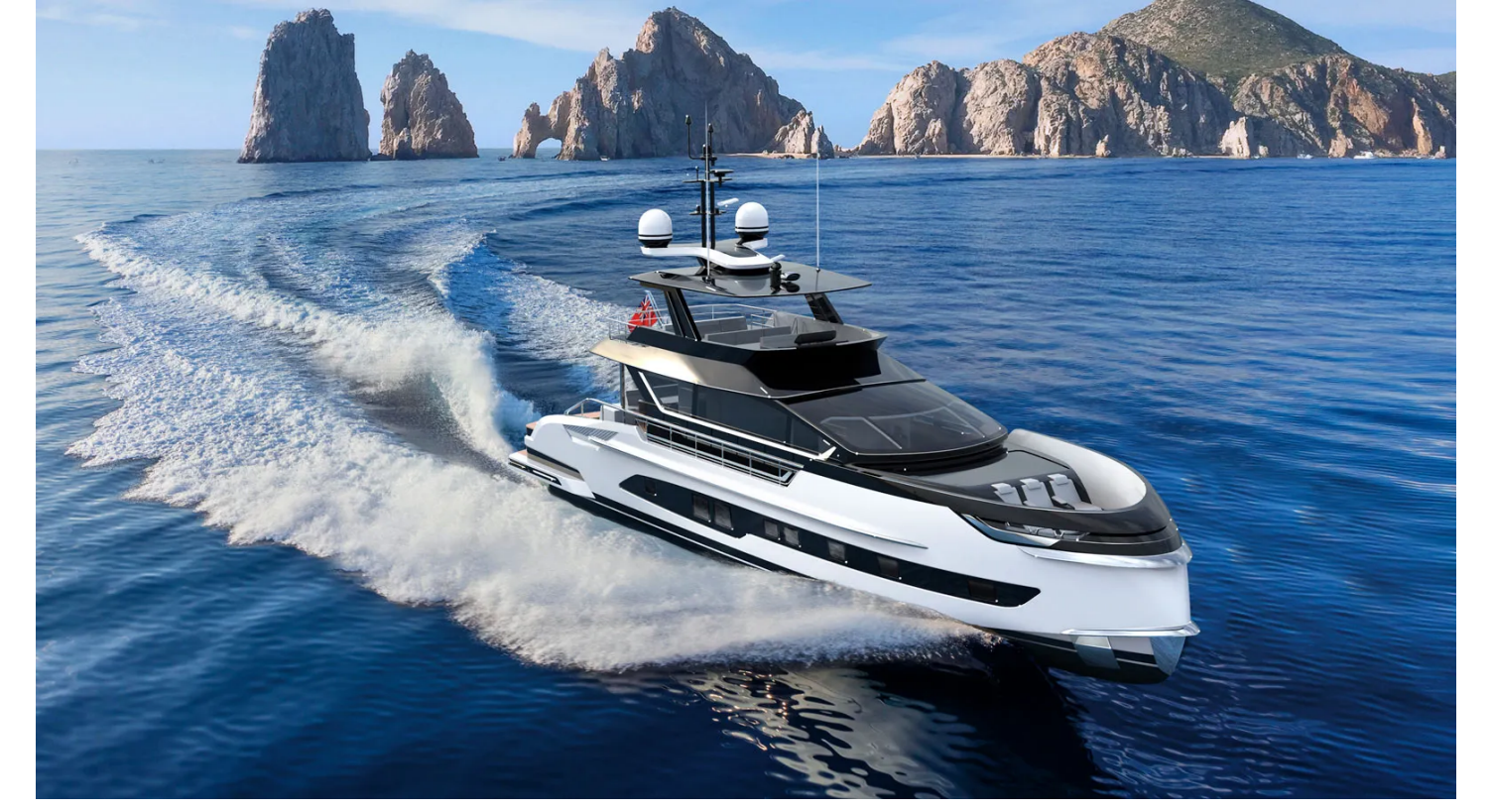
GTM 90 sports yachts

The interiors of the GTT 160 model will be penned by designer Claudio Pironi while hybrid propulsion packages will be available on every model.