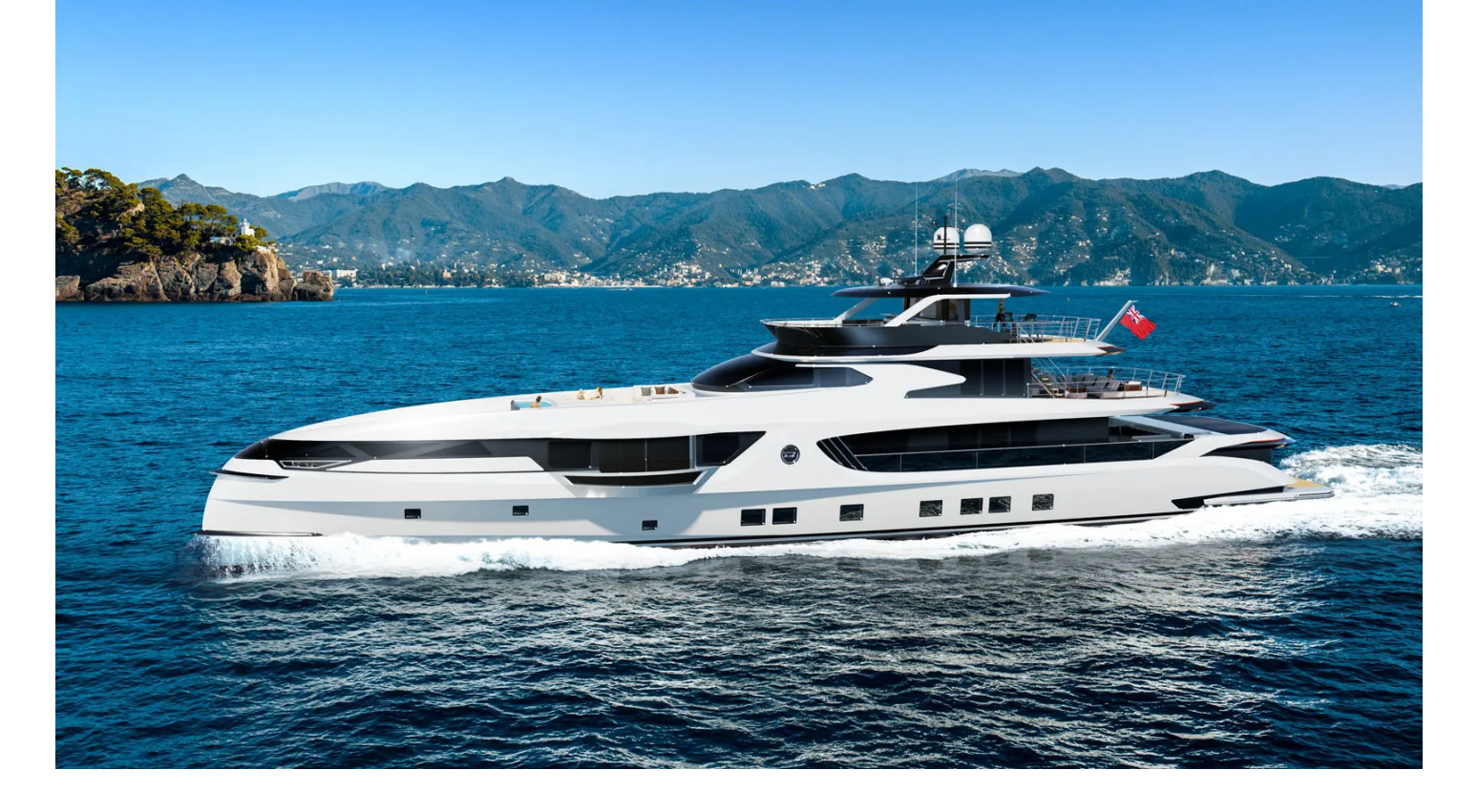
The GTT yachts are described as "sleek and elegant: with open decks and aluminium hulls. Powered by V12 MAN engines, the yachts will reach a top speed of 20~\rm knots .