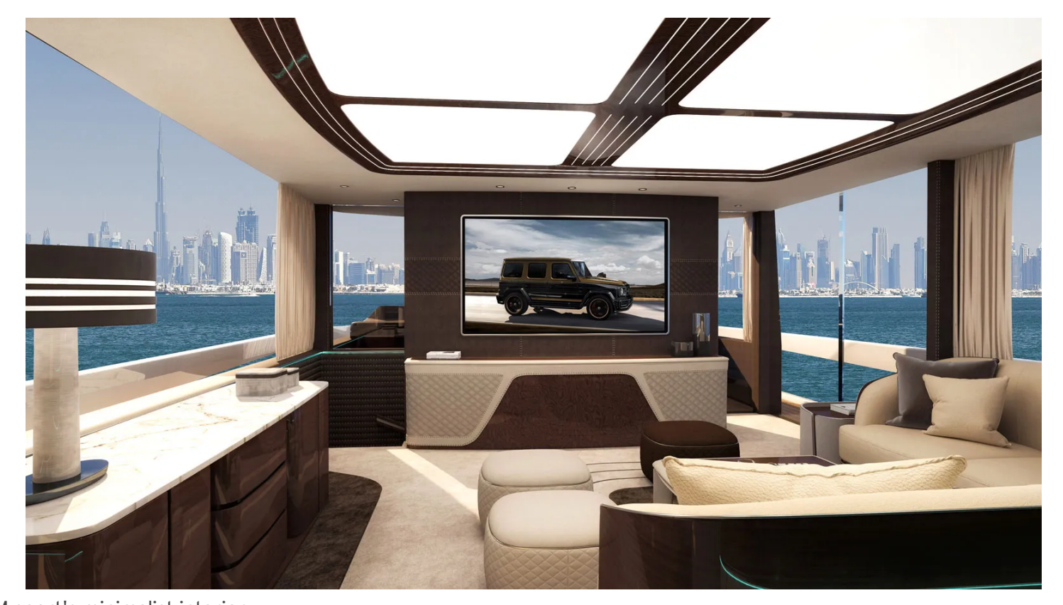
GTM sport's minimalist interior

The interiors of the GTT 160 model will be penned by designer Claudio Pironi while hybrid propulsion packages will be available on every model.