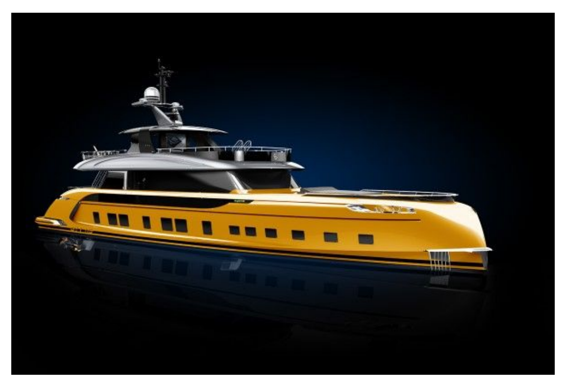
The yacht, which measures 35 metres (115 ft), is apparently

The new creation from Monaco yacht builder Dynamiq is an innovative hybrid built in partnership with the German luxury car manufacturer, even including seats from a Porsche 911R.