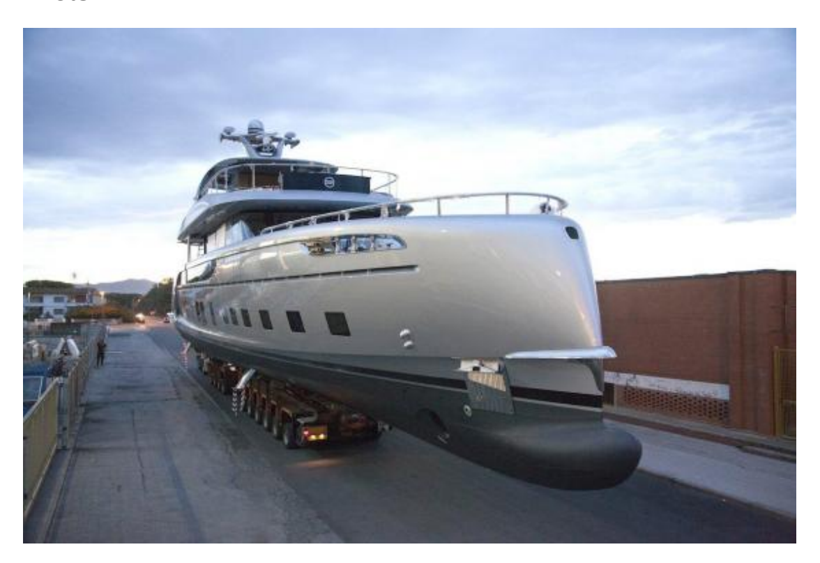
The yacht costs €13.9 million or $16.7 million. It will be novelty purchase as only 7 units have been made.

The superyacht is a hybrid that Dynamiq says offers efficient fuel consumption for 3,400 nautical miles. It can cruise at 21 knots.