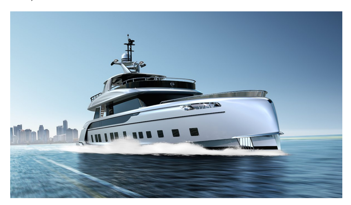
Studio F.A. Porsche

Porsche is trying its hand at yacht design.