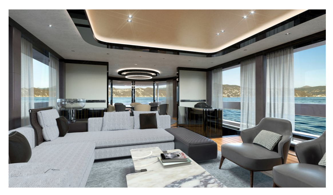
Studio F.A. Porsche

A rendering of the interior shows the yacht features hardwood floors and chocolate brown furniture.