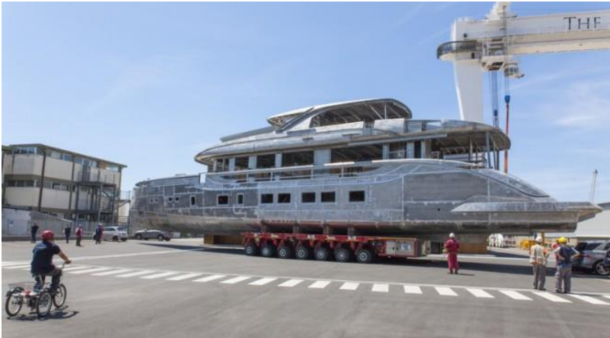
DYNAMIQ D4 Yacht – side view