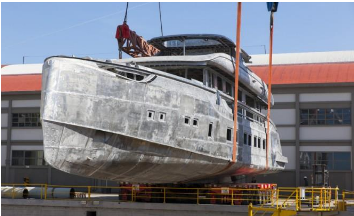
Motor yacht DYNAMIQ D4 moving

Inspired by GT car philosophy, luxury yacht DYNAMIQ D4 has been designed and equipped for everything from relaxing family cruising to vibrant deck parties. She offers speeds of over 20 knots, a generous sun deck and ocean-going autonomy. Once completed to the highest standards of comfort and safety, she is expected to be displayed at the Monaco Yacht Show 2016.