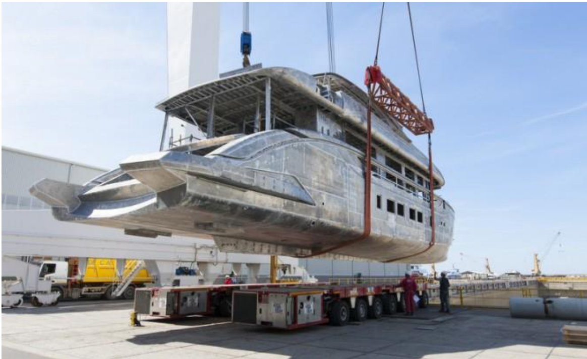
Hull and superstructure of superyacht DYNAMIQ D4 being moved to the new shed