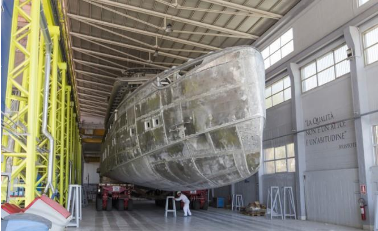
Super yacht DYNAMIQ D4 ready for outfitting