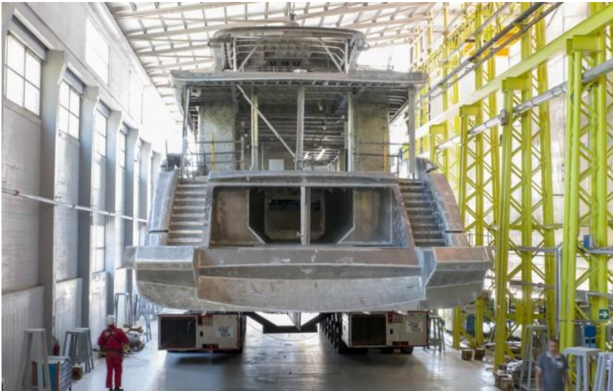
DYNAMIQ D4 superyacht entering the new shed