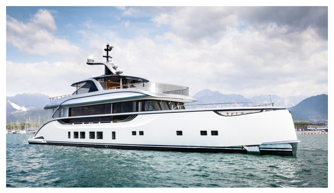
Listed for sale at \in 14,500,000 through IYC broker Scott Jones, Jetsetter is scheduled to be displayed at the upcoming Monaco Yacht Show where she will be available for viewings.