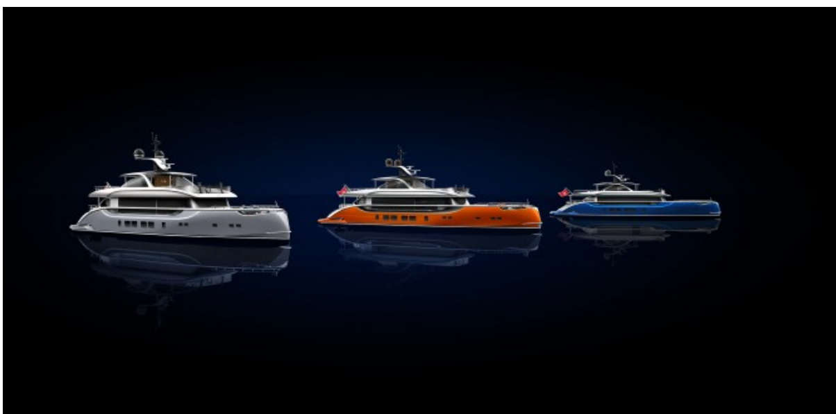
DYNAMIQ range of Superyachts