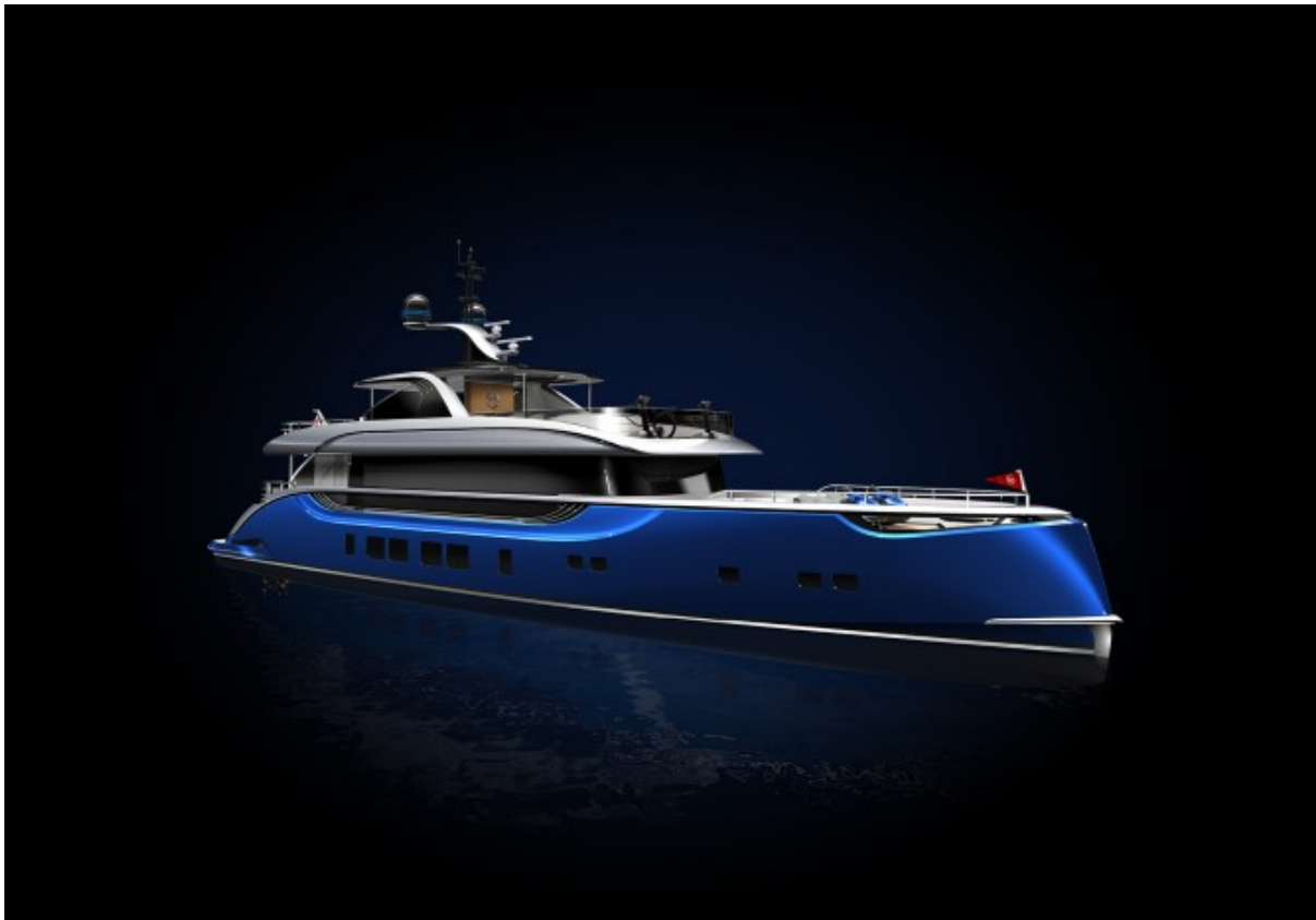
DYNAMIQ D4 Yacht in Bright Atlantic Blue

Officially launched at the Yacht Club de Monaco last week, DYNAMIQ presents a new category of superyachts: grand touring vessels for spirited long-distance journeys in supreme comfort and style, fully customizable through an online configurator, allowing clients to select everything straight on the company's website. In 2014, the keel of the first DYNAMIQ D4 yacht was laid at the NCA shipyard in Carrara, Italy . Her construction is currently well underway, with launch and delivery scheduled for Summer 2016. She will be showcased at the Monaco Yacht Show 2016 .