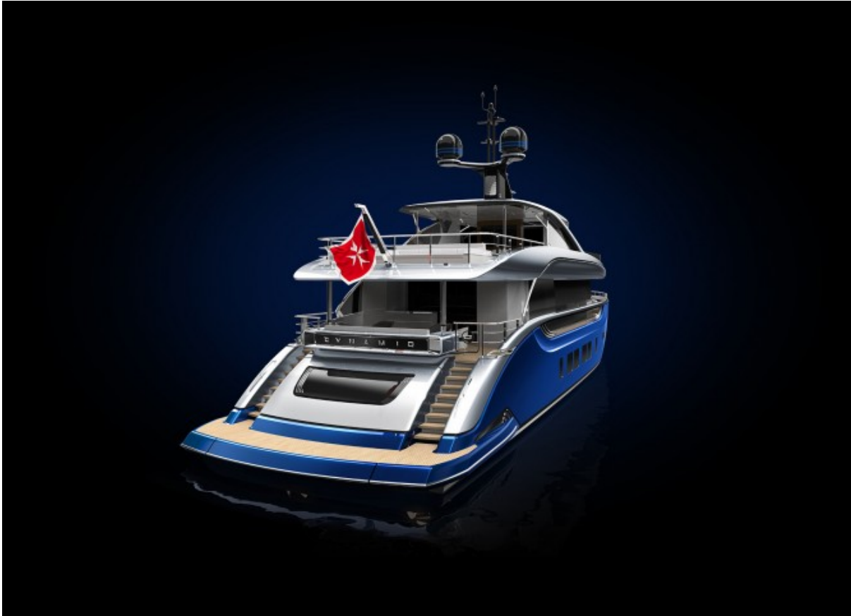
DYNAMIQ D4 superyacht in Bright Atlantic Blue – aft view

going autonomy. The top-class 120 square metre sundeck has been carefully designed with five versatile zones: an aft sunbathing area, an al-fresco dining area with optional home theatre, a bar and barbecue zone, a spa pool, as well as a forward sunbathing area, that can also be specified as an optional exterior gym.