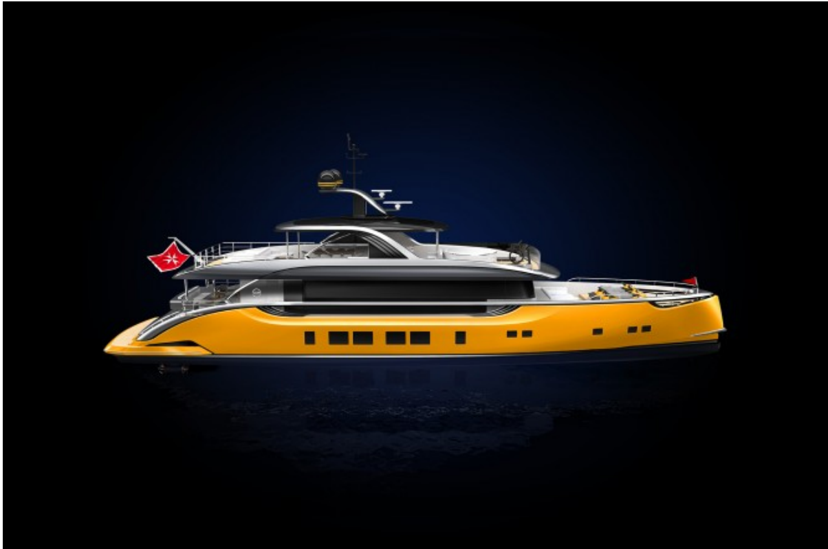
Superyacht DYNAMIQ S4 GTS Yellow

DYNAMIQ has called this new category of yachts GTT – Gran Turismo Transatlantic. They are available in three base models: the 38,6m (127') D4 base model and S4 sport version, as well as the lengthened 40m (132') D4 L limousine version. With a hull developed by the top Dutch naval architects Azure and optimisation by world-renowned hydrodynamic specialists Van Oossanen , the overall interior design has been realised by the prestigious London-based design studio Bannenberg & Rowell , and features an elegant, contemporary base style.