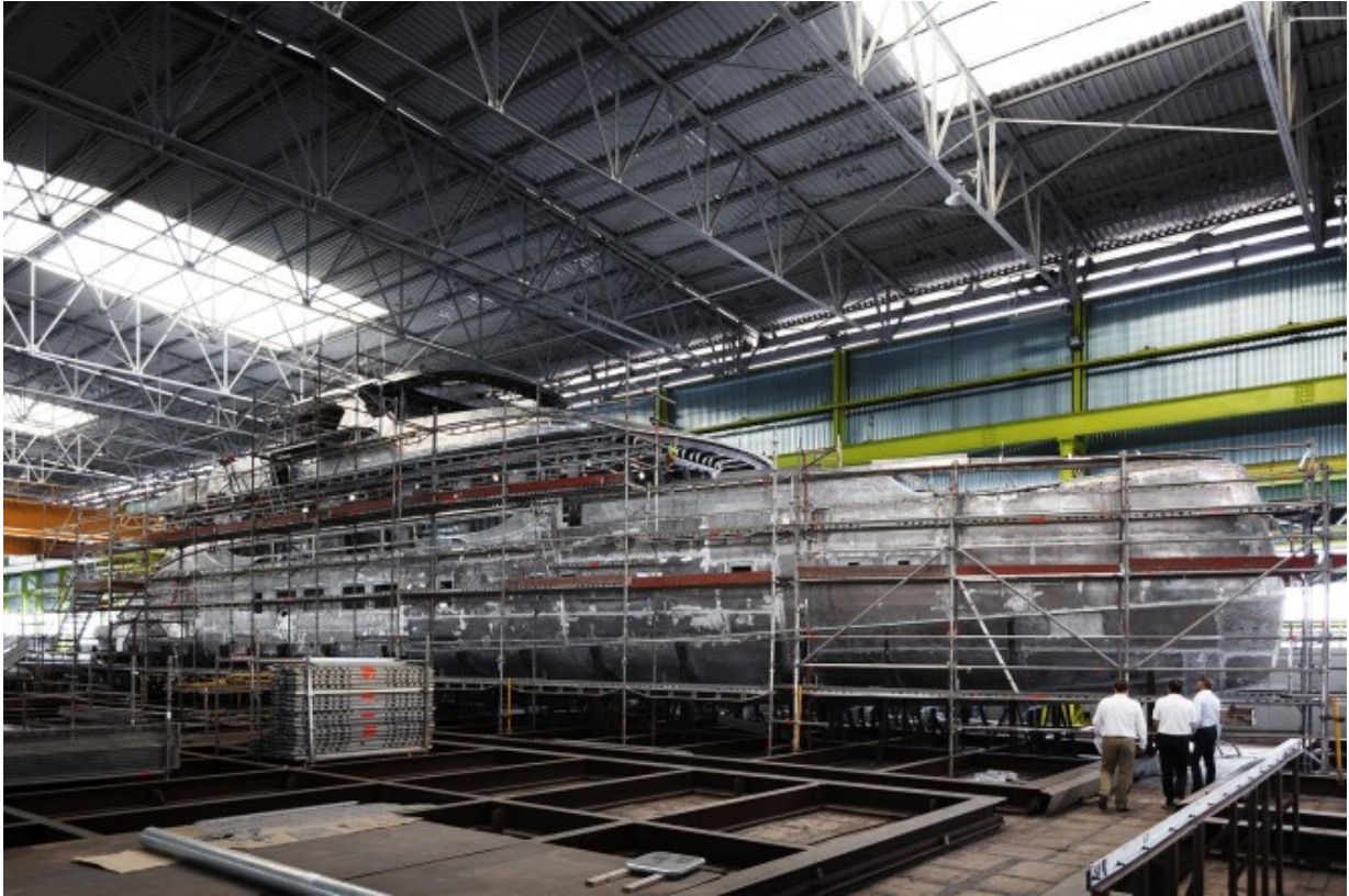
Superyacht DYNAMIQ D4 under construction – May 2015

To be built in aluminium to the highest standards of comfort, safety and emission control, all three superyacht models feature RINA Comfort Class and Green Star Plus notations, as well as LY3 commercial code equivalence. They provide deluxe accommodation in four or five guest cabins, with crew quarters for six crew members.