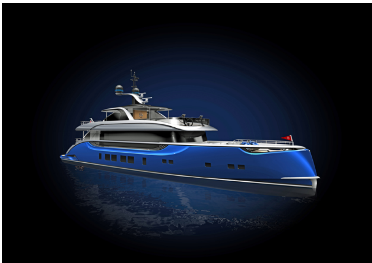
The 40D is in build and due to launch in 2016

dedicated forward dining area, while owner and guest ensuite cabins are located amidships on the lower deck. Bannenberg & Rowell have created the base interior design. Materials and finishes can be customised by the client, and there is also the option for a fully bespoke interior design from Bannenberg & Rowell for a fixed cost. The interior of the D4 in build will feature Hermès, Loro Piana and Armani Casa, THG bathroom fittings, Christofle cutlery and Baccarat glassware.