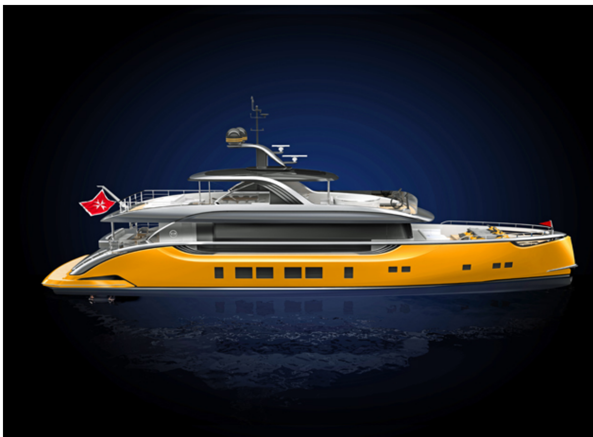
The sportier S3 offers a top speed of 25 knots

transparency in pricing and delivery schedule is set to revolutionise the way series superyachts are specified and ordered,” Dynamiq says.