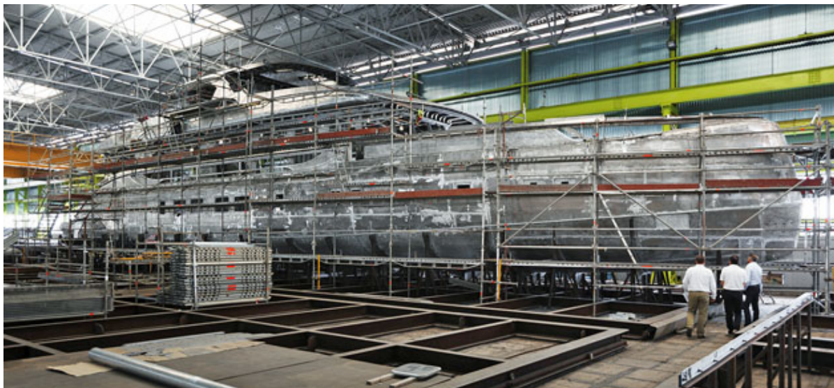
Dynamiq's D4 is currently in build