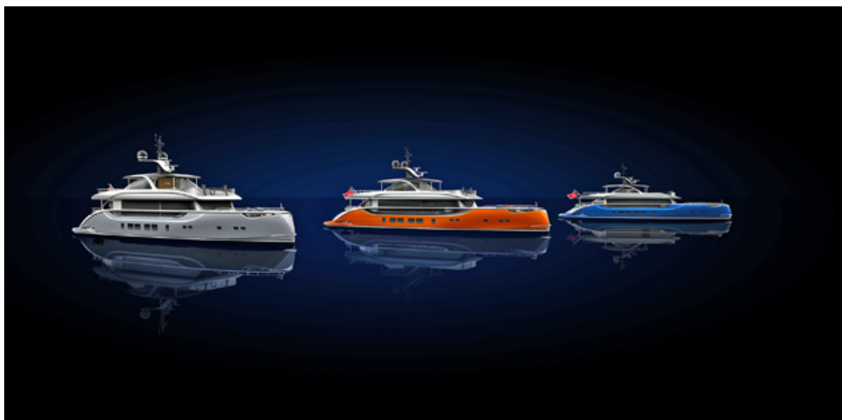
The 40 L (left), the S4 Sport and the 40D

With aluminium hulls, a shallow draught and a top speed of over 20 knots, the Dynamiq's Gran Turismo superyachts will be – says the yard – flexible cruising machines, with Monaco to St Tropez reached in just over two hours or Miami to the Galapagos on one tank of fuel. The range begins with the 36.6-metre D4, which is in build at the NCA shipyard in Carrara, Italy, and is due to launch in summer 2016. The S4 Sport model is the same LOA, while the D4 L is a 40-metre limo version of the base model.