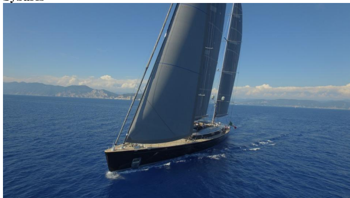
Sybaris at sea