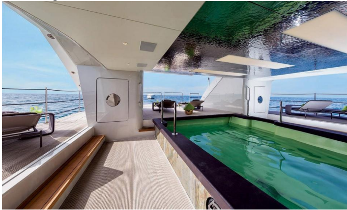
The pool on board Genesi

Taking home the MYS/Rina award which recognises the most eco-friendly yacht at the show, this yacht was built by Italian yard Wider. At 46m, there's enough room for a beach club and a swimming pool, and she can run solely on battery power for a whole night.