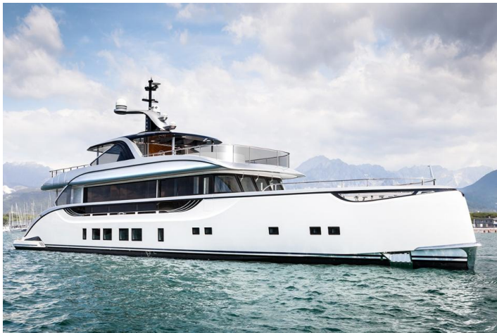
Jetsetter by Dynamiq